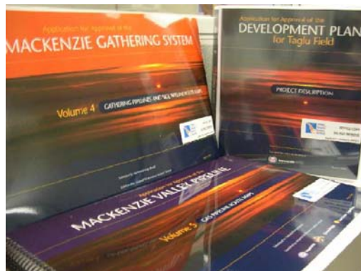
Applications for the Mackenzie Gas Project